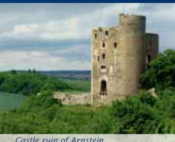
Castle ruin of Arnstein

The castle ruin of Arnstein is high above a prong declining steeply to three sides over the Einetal (valley) at the outskirts of Harkerode. It is one of the largest medieval fortress complexes of the Harz region and got its name after the house of Arnstedt. WALTER VON ARNSTEIN († around 1169) began erecting the castle probably around 1130. After the Arnsteiner died out at the end of the 13 th century, the owners changed many times. The castle was in the ownership of the family VON KNIGGE from 1812 – 1945, their mausoleum is on the base of the castle hill still today. Since then the municipality of Harkerode is the owner of the ruin. We can visit the relics of the complex. The main building is partly reconstructed. We go up the foot path from the parking place at the street between Sylda and Harkerode to the castle ruin. From there you have a phantastic view over the surrounding area.