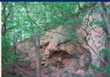
Quarry at the Klus hill