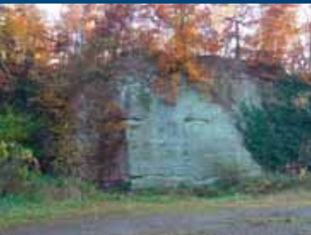
In the former quarry

Coming from Mansfeld we go towards Blumerode. After about 500 m we reach at the left hand side the former quarry. The outcropped feldspar-rich sandstones and the embedded conglomerates and claystones are formed in the Upper Carboniferous about 300 million years ago. They are sediments of the Variscian mountains, which were washed up by rivers in the foreland. Remarkable are the petrified woods. Fragments of tree trunks show partly well visible cell structures. Some of these tree trunks were exhibited in the parks of Siebigerode. The sandstone was used as construction stone for churches amongst others in Siebigerode and Eisleben as well as for gravestones and feeding troughs, also used for manufacturing mill stones. Privately and state-owned operated quarries manufactured up to 1,000 mill stones annually in the 18 th century.