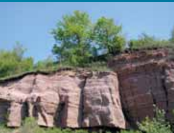
Outcrop in the Tal der Heiligen Reiser

Behind the undercrossing of a railway embankment between the promenade and the Talstraße we go left and follow the signs. Thus we reach an impressive outcrop, the “Grand Canyon” of the Mansfelder Land. Here, in the Tal der Heiligen Reiser (valley), a weak adjustment (angle discordance) between the Upper Carboniferous argillites and the micaceous sandstones to the Upper Rotliegend porphyry conglomerates of the “Eisleben Beds” laying above can be seen. What you see is a considerable time gap, because the Hornburg layers are completely missing. From the Tal der Heiligen Reiser a walking trail leads to Oberwiederstedt. GEORG PHILIPP FRIEDRICH VON HARDENBERG († 1801), known as NOVALIS, was born in the local Renaissance castle. The miner specialist and lawyer made history as a poet of early Romanticism. The castle is a museum today.