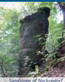
Sandstone of Neckendorf

Sandstone was broken there on several places and used in many buildings of the region. Coming from Neckendorf we reach along the Grund after about 1 km in the forested northern hillside the dumps and quarries of the quarry operation, closed down only in the 1930s. Shortly behind it we see the Teufelsgrund. The vernacular made out of cliffs and crevices the pulpit and kitchen of the devil. Further westward there are more cliffs and small quarries, the most western one is the former quarry Dockhorn. Still today the red-coloured sediment rocks of the Upper Rotliegend are well outcropped on its walls.