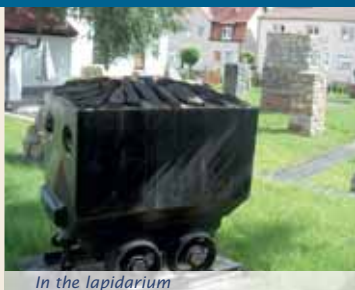
In the lapidarium