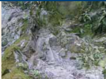
Outcrop at the Klipp mill