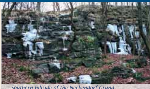
Southern hillside of the Neckendorf Grund

According to latest studies they are approximately 265 million years old.