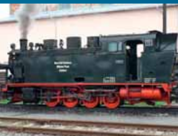
Mansfeld mine train

On 15 th November 1880 a narrow-gauge railway (750 mm) over a distance of 5 km was put into operation for the transport of copper shale from the Glückhilfsschächte (mines) at Welfesholz to the Kupferkammerhütte (smelting works) in Hettstedt. The route network was extended to all extraction pits and smelter between Eisleben and Hettstedt in the following years. In 1969 all pits were closed, the end of the train impending. Until 1990 the railway track, shrunk to about 20 km in length, merely served for the transport of intermediate goods in and between the smelter in Helbra and Hettstedt. The Verein Mansfelder Bergwerksbahn e. V. (Association of Mansfeld Mine Train reg. association) maintains a train operation on the remaining track Klostermansfeld – Hettstedt for the museum using steam trains and diesel locomotives.