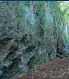
Geologic outcrop Walbeck

We find an interesting geologic outcrop in the Zoo Walbeck. The argillaceous slate of the Lower Carboniferous contains fossil plant remains. Animal species of the indigenous fauna, different breeds of farm animals and some exotic birds live in the enclosures of the Zoo Walbeck – a part of the old palace garden. We go through the zoo and a further hundred metres towards the valley to the “Planteur” house. We pass the impressive “Adelheid” oak. The Adelheidquelle (Adelheid spring) encircled by sandstones can be found on the opposite downhill side. Passing a pond we finally get to the “Planteur” house. The neoclassical house was built by the former castle owner for the gardener in 1802, who was responsible for the trees in the extensive park. About 20,000 fruit trees supposedly have stood here when the owner died in 1817. The “Planteur” house is in private property today.