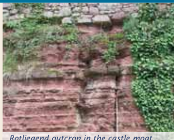
Rotliegend outcrop in the castle moat

land. In 1780 it fell to the Prussian State. The family VON DER RECKE purchased it in the 19 th century. They had a residential house erected on the ruins of Vorderort castle in neo-Gothic style. Therewith the castle finally got today's appearance. In 1947 the Mansfeld Castle was handed over to the use of the Protestant church and has been in the ownership of the friends' association castle Mansfeld since 1999. Substantial restructuring measures have been carried out in the last years and currently the castle is used as a Christian youth centre for education and encounter.