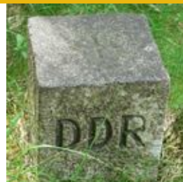
East German border marker