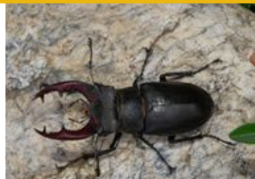
European Stag Beetle