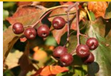
Fruit of the wild service tree