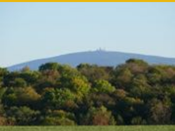
View of the Brocken

The European beech is the most vigorously competitive species of tree in Germany and across large parts of Central Europe. On soils with sufficient nutrients which are neither too wet or too dry, it dominates natural and semi-natural forests from the north German lowlands up into low mountain ranges. What makes the European beech so successful? In the shade cast by its dense leaf canopy its competitors are completely denied direct sunlight. Even beech saplings only have a chance to thrive when dense forest is thinned out. This opportunity is today provided by commercial forestry practices, long before older trees die naturally. Only early in spring, before the leaf canopy has closed, does lush life unfold on the forest floor. If the soil is fertile loess, for example, then demanding species such as wood anemone and sweet woodruff may be present.