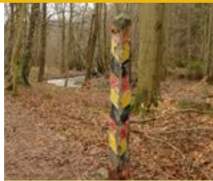
East German border marker