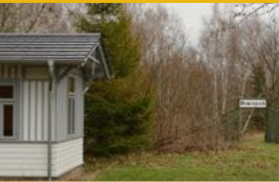
"Light-and-air" hut at Damenpark

M ore than anything else it is the marker stones from 1846 that remind us that, in walking along the Ecker River, we are also walking along a border. They mark the former border between the Duchy of Braunschweig and the Kingdom of Prussia. The "B" faces the Braunschweig side and the "P" the Prussian side. Today the border separates the states of Lower Saxony (B) and Saxony-Anhalt (P). Naturally, we find beech forest in the river valley. The birches to the east bear witness to the area that was kept vegetation-free on the East German side of the border. At the spot where we cross the L 85 once more, a large, brown information board reminds us of the border opening on November 11, 1989. We have already put 4.6 km behind us. Those who don't wish to continue on can return to Stapelburg railway station through the town (1,7 km). Following the Harz Monasteries Trail to the railway station in Vienenburg is a further 12 km!