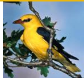
European Golden Oriole

T his starling-sized bird lives among the trees in alluvial forests. They do not even have to go down to the ground when searching for food. Generally, they comb through the crowns of broadleaf trees, searching for beetles, bugs, butterflies and caterpillars. Like the fox, the oriole does not ignore fruit and they can use their powerful beaks to pluck cherries fresh from the tree. Orioles return from overwintering in central and southern Africa at the beginning of May, their migratory route taking them over the Balkans as they return to their breeding territories in Lower Saxony. There, after mating, a nest is built hanging from the two boughs of a forked branch. Litter in the form of string, or even torn paper and plastic film, are often artfully woven together with birch bark and plant stems. Despite the oriole's bright colours and tuneful singing, it often remains hidden from bird-watchers.