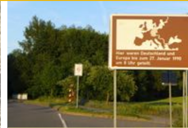
State border near Lochtum

The border separated two power blocs for decades after the Second World War. On the western side of the border began the Western world, led by the USA. NATO's central European eastern flank stretched to this point, and the British Army of the Rhine operated here. On the eastern banks of the Ecker and Oker Rivers stood troops of another military alliance – the Warsaw Pact, led by the Soviet Union. Even after the Warsaw Pact's collapse in 1991, there was a Russian military presence on the nearby summit of the Brocken until 1994. Nevertheless: the opening of the Inner German border and the ensuing summit between President George Bush Snr. (USA) and Mikhail Gorbachev (USSR) on Malta in December, 1989, heralded the end of the Cold War!