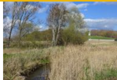
... and in the Geopark, near Hötensleben

access roads. Closer to the border (originally the border of the Soviet Occupation Zone) was the "protective zone" which was, in places, up to several hundred metres wide. It was secured with a signal fence which automatically set off an alarm when touched. Farmers working in fields in this zone were overseen by soldiers from the Border Troops of the GDR. Members of 27 companies of the Border Command North, based in Stendal, including soldiers performing compulsory military service, guarded the border complex 24 hours a day, including where it ran through the Harz Mountains.