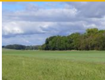
View over the Stimmecke valley

S timmecke channel is protected as a SCI in both Lower Saxony and Saxony-Anhalt. It flows into the Ilse. Like the Ecker River, which rises at an altitude of 893 m ASL in the Brocken area, the Ilse is a tributary of the Oker. About 1 km outside Stapelburg the Stimmecke channel is formed using water diverted from the Ecker River and, almost 13.9 km later, it flows into the Ilse near Rimbeck in Saxony-Anhalt. For 1,157 m it flows through Lower Saxony. The diversion dam southwest of Stapelburg is a narrowing of the river creating using gabions. The Ecker retains about two thirds of its volume, with the other third finding its way into the 32 km 2 catchment area of the Stimmecke. The Stimmecke channel represents the habitat type of a watercourse with aquatic vegetation. The banks are natural and steep. The European bullhead is found in its waters.