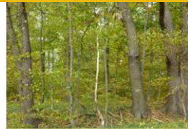
Oak-hornbeam forest in Harly Forest