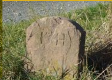
Historical border marker of Hanover

"Attention! Border in Centre of River – Federal Border Guard" could be seen written in black and red on white signs along the Ecker River in Lower-Saxony until 1989. Here and there on the opposite bank, granite stones can still be found with the letters "DDR" on one side. Coloured border markers made of concrete and bearing the national emblem of East Germany have, almost without exception, disappeared. The border was impregnable until November 11, 1989, when it was opened near Stapelburg.