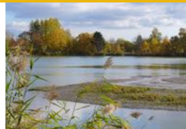
Abandoned gravel quarry