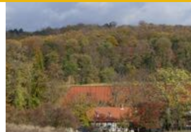
View of Harly Forest