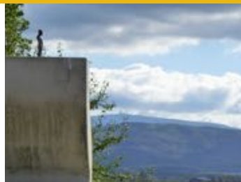
Border memorial "Begegnung II"