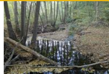
Alluvial forest in the Ecker River Valley