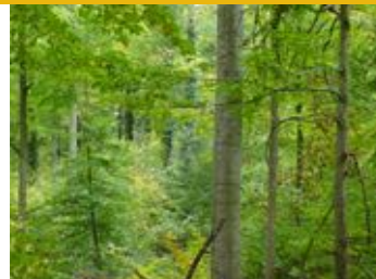
Beech forest in Harly Forest