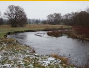
Oker River near Wiedelah

The habitat type of watercourses with floating aquatic vegetation includes both natural and semi-natural rivers and streams. The formation of substrate banks, bank erosion and areas of aggradation are typical and result in variegated landforms along the watercourses. Depending on the current, water depth, amount of shade and the substrate, a variety of vegetation can be found in and next to the water. In clear water, flooded with sunlight in the Oker and Ecker Rivers we find, above all, water mosses, which form a green cushion on the stream bed. Fauna like the banded demoiselle, the brook lamprey (a fish similar to an eel), the kingfisher and the white-throated dipper can be observed. The banks of the Ecker are lined over extensive stretches with alluvial forests with Alnus glutinosa and Fraxinus excelsior (habitat type 91Eo). Along the Oker River, on gravel banks, we often find Calaminarian grassland (habitat type 6130).