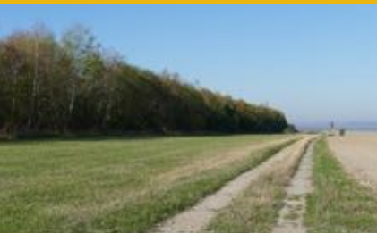
Former border patrol road

Then came anti-vehicle trenches and/or steel barriers – so called "chevaux de frise" – and sometimes also running lines for guard dogs. The wall or metal mesh fence itself was 3 m high. Climbing these was hindered by barbed wire, smooth metal pipes, or directional anti-personnel mines. Land mines were laid within the adjoining no mans land. Only beyond the no mans land were there border markers and the border itself, often the centre-line of a watercourse such as the Ecker River. Due to the inaccessibility of the no mans land, unique communities of fauna and flora were able to develop, adapted to specific habitats, principally fallow land. As this land remained unfertilised, vegetation was sparse, but species-rich. Sunlight reached the soil surface which benefited a diverse insect community. Whinchats and European stonechats used overhanging branches as vantage points from which to sing or to spot prey. This is how the German Green