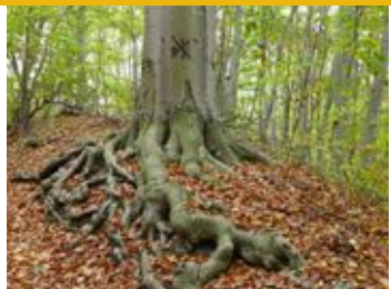
European beech on Harly Hill