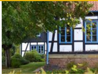
Former forestry building