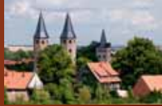
Evangelisches Zentrum Kloster Drübeck www.kloster-druebeck.de