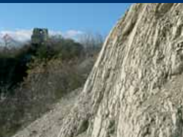
Limestone quarry & Horstberg Tower

Leaving Wernigerode on the old B 6 towards Blankenburg at the city exit, we see to the left the remains of an old roadway defense tower on the Horstberg. Along the path on the crest we discover an old quarry which has been left exposed. The Horstberg manifests two linear hogback zones. The Terebratelbank of the Lower Muschelkalk well as the Trochitenkalk zone of the Upper Muschelkalk emerge as hogback structures. The sediment layers of Middle Muschelkalk between the hogbacks consist of soft dolomitic limestones, which gave way to the forces of erosion and thus formed a depression. In the central portion of the quarry, the vertical position and overthrust of the strata in the Harznordrand Fault can be observed. Here the Schaumkalk limestone beds of the Wellenkalk formations were extracted in the old quarry. From the peak, we have a panoramic view across the Subhercynic Basin of the Harz foreland.