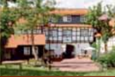
Hotel „Am Anger“ Wernigerode www.hotel-am-anger.de