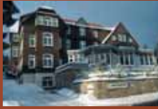
Hotel „Der Kräuterhof“ Drei Annen Hohne www.hotel-kraeuterhof.de