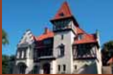
Hotel - Restaurant „Schlossvilla Derenburg“ www.schlossvilla-derenburg.de