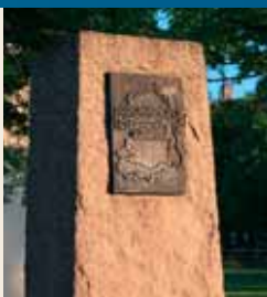
Ice-age memorial stone

and natural scientist HERMANN LÖNS (1866 – 1914) described Wernigerode as the "Colorful Town by the Harz". The city hall was first mentioned as a building in the year 1277. After a fire which devastated the town in the 16 th century, the city hall was redesigned in its present form. The market fountain displays the coat of arms of the counts of Stolberg, who took over the rule of the town after the family of Wernigerode counts died out in 1429. In 1714, Count CHRISTIAN ERNST ZU STOLBERG-WERNIGERODE (1691 – 1771) acknowledged the sovereignty of Brandenburg-Prussia over the county of Wernigerode. Next to the city hall, a building constructed in 1821 as a private residence at Klint 10 now houses the Harz Museum (natural history and a section devoted to the history of the town.) Starting from the market place, the "Breite Straße" passes the Krell Smithy (1678), now the Harz Cultural Center. Across from the large parking lot stands the ice-age memorial stone marking the rim of the former glacier.