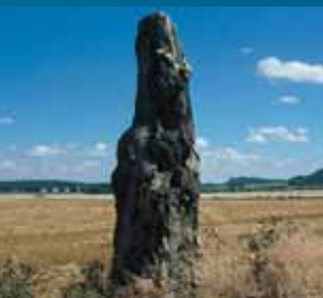
One of the three menhires

According to the legend, three giants once wanted to reach a decision through a stone-throwing competition as to which one of them was to receive a much courted farm girl as his wife. But in the end, as they realized that the stones they had thrown were different in size, none of them could be declared the victor. The giants departed from one another in anger and left the region. What remained were the upright stone columns, not far away from the B 6, two to the north, one to the south of the highway in the wide plain between Heimburg and Silstedt. These are the menhirs of Benzigerode. In the course of archaeological excavations accompanying construction of the four-lane B 6, substantial evidence of a settlement in the Neolithic period was uncovered in 2001, including a hut for the dead in which ca. 40 people were buried in the time of the Bernburg Culture (3,400 to 2,800 B. C.).