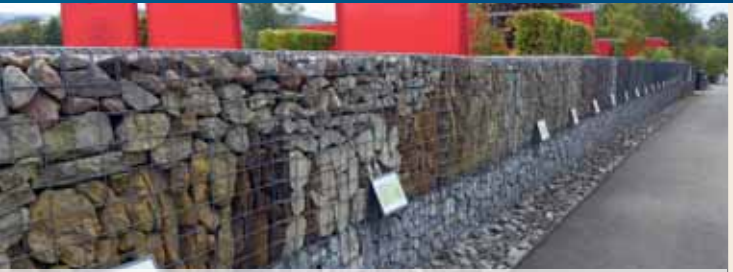
Sections of the "Mineral Canyon"

Under the motto “Experience Harz Views”, the State Garden Exhibition of 2006 in Wernigerode created new landscapes within the city. Between the “Kurtsteich” and the “Schreiberteich” a “Mineral Canyon” now cuts through the area. Over the length of 48 meters, it contains a “geological window” with rocks and minerals that would manifest themselves in a subterranean cut with a profile 15 kilometers long extending from the Lustberg near Schmatzfeld northwards over the Schlossberg Wernigerode, past the mining museum “Büchenberg” all the way to the Hahnekopf in the Bodetal by Rübeland to the south. This “window” offers us insights into the relationships of landscape forms, stones and geological structure as we view the respective stone fragments of the geological cut in each section. The first of 24 sections contain the rocks of the northern Harz foreland: sandstone and marl