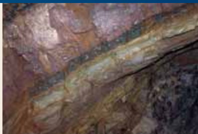
In the Show Mine

viewed on the tour around the shaft and in the orebody No. 5. Through activation of the starting mechanism of the industrial cable railway and a demonstration of the drills, overhead loader and a scraper at work, we can sense the true atmosphere of the mine. Iron ore mining has been taking place in the proximity of Elbingerode since the 10 th century, but actually it began at an even earlier date. The primary metal ore won here was calcareous hematite, which proved to be a useful addition in the production of the sour Salzgitter ores. After the end of the war, the Harz iron ore mines – Büchenberg and Braunesumpf – were an important source for GDR raw iron provisions. In the last period of mining, the most important ore minerals won here were magnetite, siderite and hematite with quartz additions. A mining information path traverses the historical mining region and follows the former border between the Kingdom of Hanover and the Duchy of Brunswick.