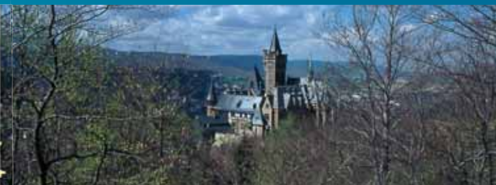
View of the castle from the Agnesberg

Today, on two different visitation tours, 50 rooms can be viewed. As building material for the castle ensemble, work stones from the region were used. The gateway entrance house to the castle has a façade of yellow rogenstein comprised of tiny spheres which recall fish eggs. Rogenstein, along with reddish sandstones of the