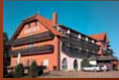
Hotel „Blocksberg“ Wernigerode-Silstedt www.hotel-blocksberg.de