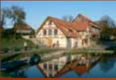
„Zum Klosterfischer“ Blankenburg/Michaelstein www.klosterfischer.de