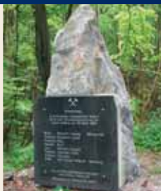
Monument from 2007

this cave is situated on two parallel north-south running clefs, both dipping approximately 60 degrees westward. In the 9 th century, a woman is said to have lived here as a hermit in the cave. A church "Michaelskirche" is also mentioned in connection with this site. Incised in the rock walls are two dedication crosses. Later, a hermitage site for the legendary "Volkmar Brothers" (monks) was located here. In 1146, the Cistercian monks settled on the site. The foundations above the cave are probably the remains of this first cloister Michaelstein, which was later relocated lower in the valley (Landmark 9). A narrow tunnel connected the former cloister to the cave church. Archaeological finds attest that, already in this period, iron ore was smelted in the bloomery furnaces at the Eggeröder Brunnen. Iron ore mining was also carried out in the 19 th century in the Klostergrund. On March 16, 1893, a dynamite explosion occurred in the Volkmar mine, killing eight miners. Their loss is commemorated on a memorial stone in the Klostergrund.