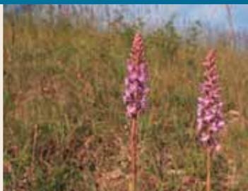
Orchid Gymnadenia conopsea

early cultural life here is to be found in pre-historic and early history finds as well as in the Struvenberg itself. It was originally built in the period of the Franconian conquest. This fortress surrounded by earthen mounds, typical for the Harz, is located immediately east of Benzingerode on the 286 meter high western limestone crest of the Struvenberg (305,7 m NHN). An ascent is possible from the edge of the town.