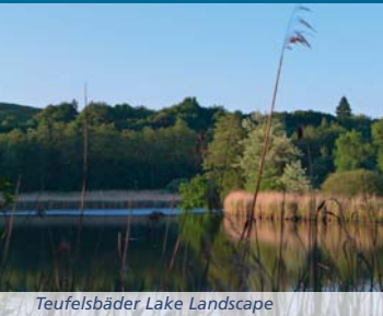
Teufelsbäder Lake Landscape

East of the railway line between Osterode and Herzberg the Harz Border basin is particularly clearly delineated. The gypsum underground has long been involved in a dissolution process. Above deeply sunk river gravel lie up to 100 m of thick boggy deposits. The water-filled basin is fed by the "Teufelsloch" ("Devil's Hole"), a vigorous intermittent spring. In the active caved surface area a lake landscape, the Teufelsbäder ("Devil's Baths"), was formed. The Großes and Kleines Teufelsbad (Large and Small Devil's Baths) resulted from dams and now silted-up fish waters. Many kinds of birds find protected breeding places in the reed-filled silted up zone. The lake landscape of the Teufelsbäder is a beautiful hiking area. The terrace gravel in the underground is an Ice Age deposit. By the end of the 20 th century the youngest gravel stratum, the lower terrace, had been extracted from a gravel pit pond between Eisdorf and Förste.