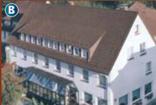
B Hotel „Zum Röddenberg“ Osterode am Harz www.hotel-zum-roeddenberg.de ☎ +49(0)5522 - 90540