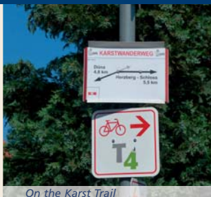
On the Karst Trail