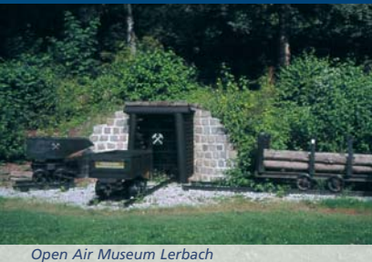
Open Air Museum Lerbach

Following one of the Söse's secondary streams from Osterode's centre through the Freiheit district we arrive at the little village of Lerbach. According to legend a knight on his way to Clausthal wanted to water his horse in the river. But he found the riverbed dry due to a severe drought in the area at the time. Back at the castle the knight cursed, „Ei du verdammter leerer Bach!“ („Oh you cursed empty stream!“). And so the village, self-governing until 1972, is said to be named after the empty stream “Lerbach” (“leerer Bach”). Both of them are still closely united, as the Lerbach stream delivers the residents of the same-named town the major portion of their drinking water. Some of the old mines serve as reservoirs for the water. They bear witness of a centuries old mining history which came to an end with the closing of the last pit in 1887. During the most recent investigations