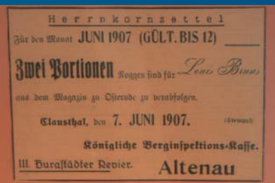
Bread Grain Ration Card

The Harz area, uplifted to form a mountain range in the Carboniferous, was mainland at the beginning of the Permian. Thereafter the mountain range was eroded extensively and the wide Germanic Basin developed. Later, still in Permian at the end of the earth's ancient age (Paleozoic era), about 258 million years ago, sea water penetrated into this basin from the north. In today's southern Harz region the "Zechstein Sea" flowed in and met the shallows and ridges. The undersea deposit strata lay flat along the upper surface of the old folded mountain belt as they were formed.