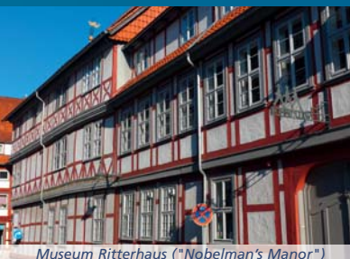
Museum Ritterhaus ("Nobelman's Manor")

Only a few steps from the restored portion of the town wall we reach an important building which takes its name „Ritterhaus“ (“Nobelman’s Manor”) from a wood carving on the cornerpost of the half-timber building. The building, originating from the second half of the 17 th century, underwent alterations in 1784/85 for the woolen ware manufacturer JOHANN LUDOLPH GREVE. The ornamental Rokoko vestibule framework with the family coat of arms dates from the same time. The city museum has an impressive presentation of municipal and regional history on three floors and in a total of eleven divisions. In the “Rittersaal”, the large storage hall with leaded glass windows, special exhibits are presented regularly. In connection with the Geopark a visit to the permanent exhibits “Geology of the Harz and its Forelands”, “Gypsum” as well as “Prehistoric and Early History” (all in German) are particularly recommended.