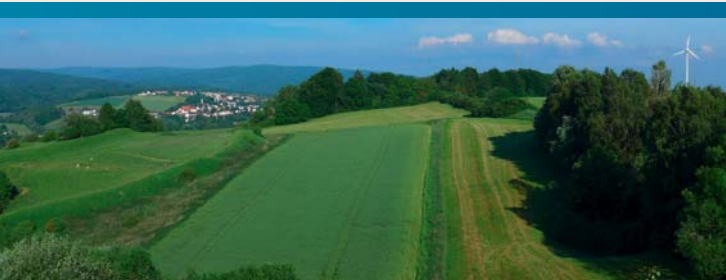
View of the Grass-overgrown Fortress Walls (left)

Below Osterode's Old Town three iron ore smelters were established on the Söse at the end of the 16 th century. Surrounding two of the smelters small settlements developed: Petershütte and Katzenstein. They have long since become incorporated in the townscape. There where the Söse runs into the Osteroder Kalkberge a mountain spur has survived gypsum leaching until today and on it the important archeological site, the Pipinsburg, is located. An overgrown ravine (hollowed out trail) leads upwards from the Katzenstein. Above on the plateau the Karst Trail leads quite near the fortress, of which today only the grass-covered walls are discerable. We cannot miss them, though, as an information board marks the history-laden location. The first documented mention of the fortress is from 1134. By 1365 it had already been destroyed. Among the findings from archeological diggings are ceramics, jewelry and goods