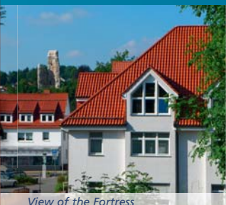
View of the Fortress

Originally the „Alte Burg“ (“Old Fortress“) served to defend the crossing point over the Söse stream and the adjacent market settlement. Since its first documented mention in the 12 th century it was in Welp possession. In the 14 th /15 th centuries it was therewith also the seat of the dukes who reigned over the principality of Grubenhagen and then, finally, it was the widows' residence. The last resident at the beginning of the 16 th century was ELISABETH VON WALDECK (about 1455–1513), widow of ALBRECHT II., Duke of Brunswick-Lüneburg, who until his death was the ruling Prince of Brunswick-Grubenhagen. Deterioration of the ground upon which it was erected most probably forced the abandonment of the fortress. Remaining in a half-cylinder form is the original five-story Romanesque residential tower. The still mighty structure stands today in the midst of the town cemetery. The tower with a base diameter of