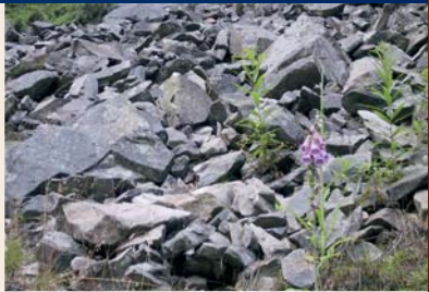
Talus Rock Formation